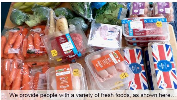
We provide people with a variety of fresh foods, as shown here...

The Jubilee Centre remains open (9.00am-4.00pm) but in the event that no one is there we have a box in the porch where donations can be placed.