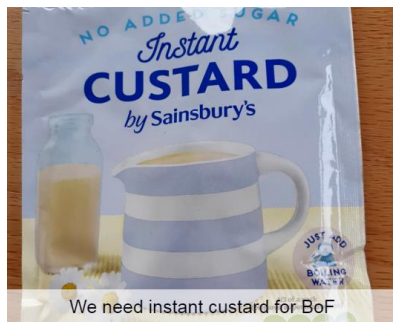
We need instant custard for BoF

New posters are on display around the area and leaflets have been delivered to a large number of homes in the area as we reach out to help more families. Please pray that we grow our capacity to support our community in response to this.